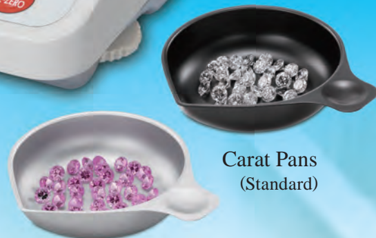
Carat Pans (Standard)