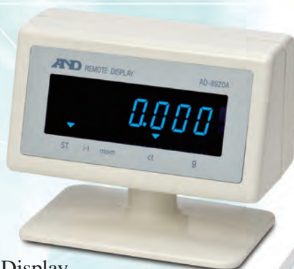
Remote Display (Optional)