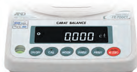
Reverse-backlit LCD display and plain key alignment

The contrast of the black and white display is extremely easy to read and prevents fatigue of your eyes. Combined with plain key alignment, the user-friendly display eliminates confusion and errors, and makes your long hours of work less tiresome.