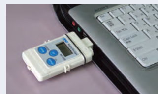
and Retrieve the Data!

As with the AD-1687 weighing environment logger, the AD-1688 becomes especially handy where a PC or printer cannot be placed near the weighing instrument, such as clean rooms.